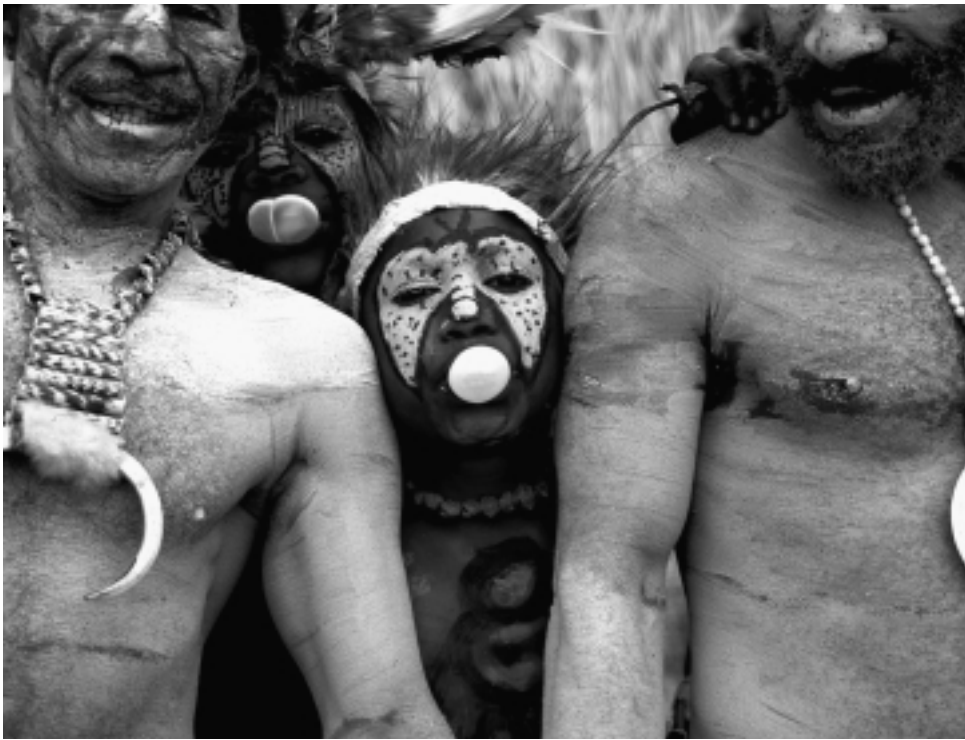
The highland cultures of Papua New Guinea were not discovered by Westerners until the 1930s. Although much has changed since then, some things thankfully remain the same. This playful moment during the annual cultural sing-sing at Mt. Hagen reminds me that children are the same all around the world, even in some of the most remote regions of our planet.

But learning photography is like learning a new language: amateur snapshots are the few words necessary for elemental communication, whereas the images created by gifted professionals, those that inspire and enrich our soul, are the equivalent of poetry.