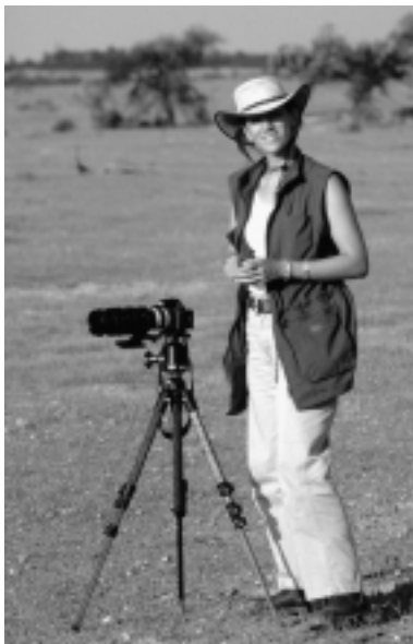
Article author Cristina Mittermeier at work in Australia.

Nature photography is one of the most versatile artistic endeavors. It allows practitioners to specialize in myriad particular subjects within the natural world, from numerous different perspectives—from the journalistic documentation of a species or a landscape, to gallery-quality printed pieces of fine art depicting flora or fauna, macro- or microscale, realistic or impressionistic. The possible subjects and areas of specialization are as diverse as nature itself.