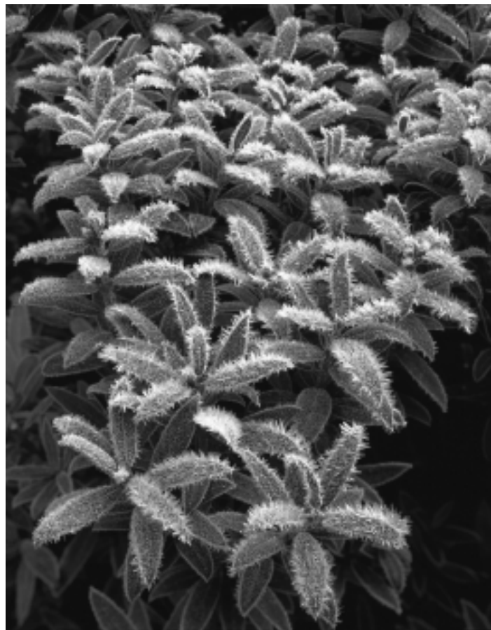
Frost on Snow Berry ( Gaultheria hispidula) leaves, Milles Track, June, Mount Wellington, Tasmania.

At the center of the opposition to dam Lake Pedder was Lithuanian-born photographer and conservationist Olegas Truchanas, a man who eventually became a mentor and father figure for Peter Dombrovskis, who was himself a Latvian immigrant. Armed